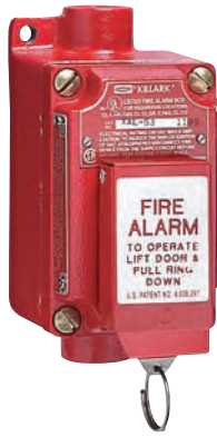
XAL Pull Ring