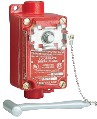
XAS Break Glass

Class I, Div. 1 & 2, Groups C,D Class I, Zones 1 & 2, Groups IIB, IIA Class II, Div. 1 & 2, Groups E,F,G Class III NEMA 7(C,D) 9(E,F,G)